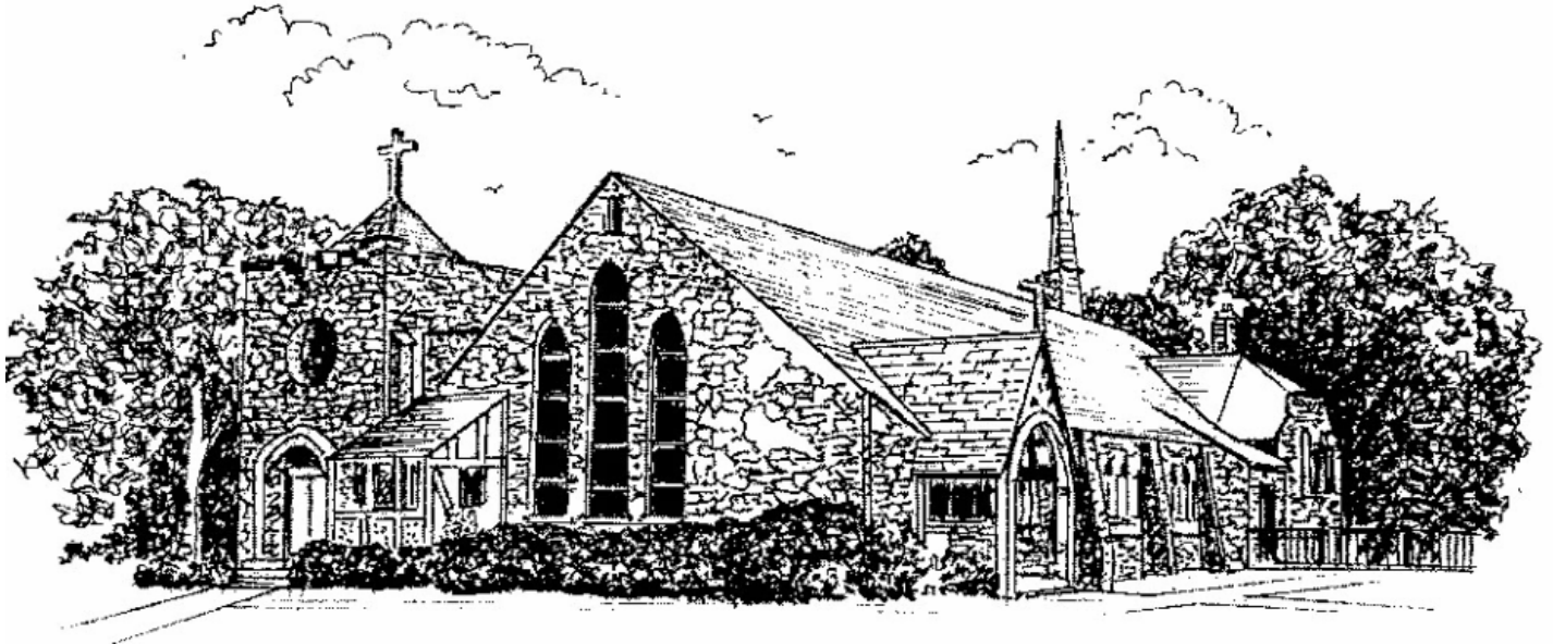
Our Lady of Good Counsel Mission Church