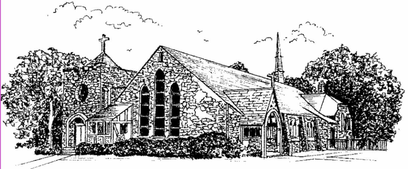
Our Lady of Good Counsel Mission Church