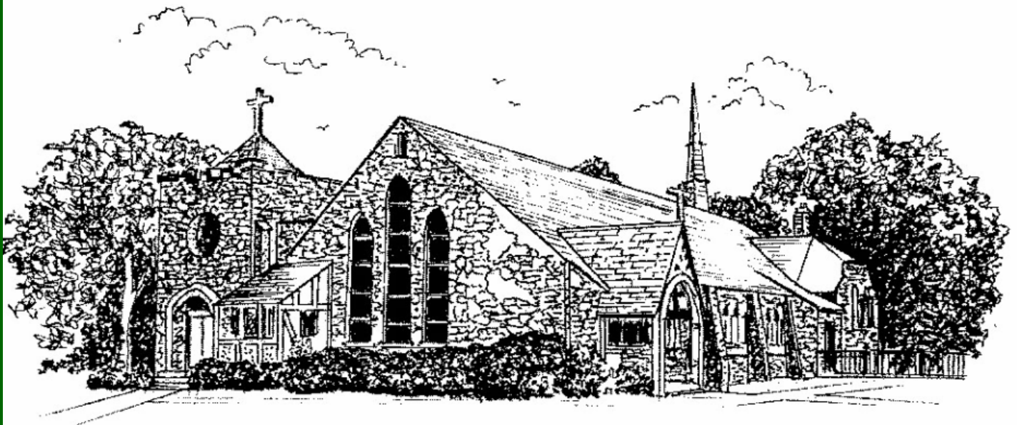
Our Lady of Good Counsel Mission Church