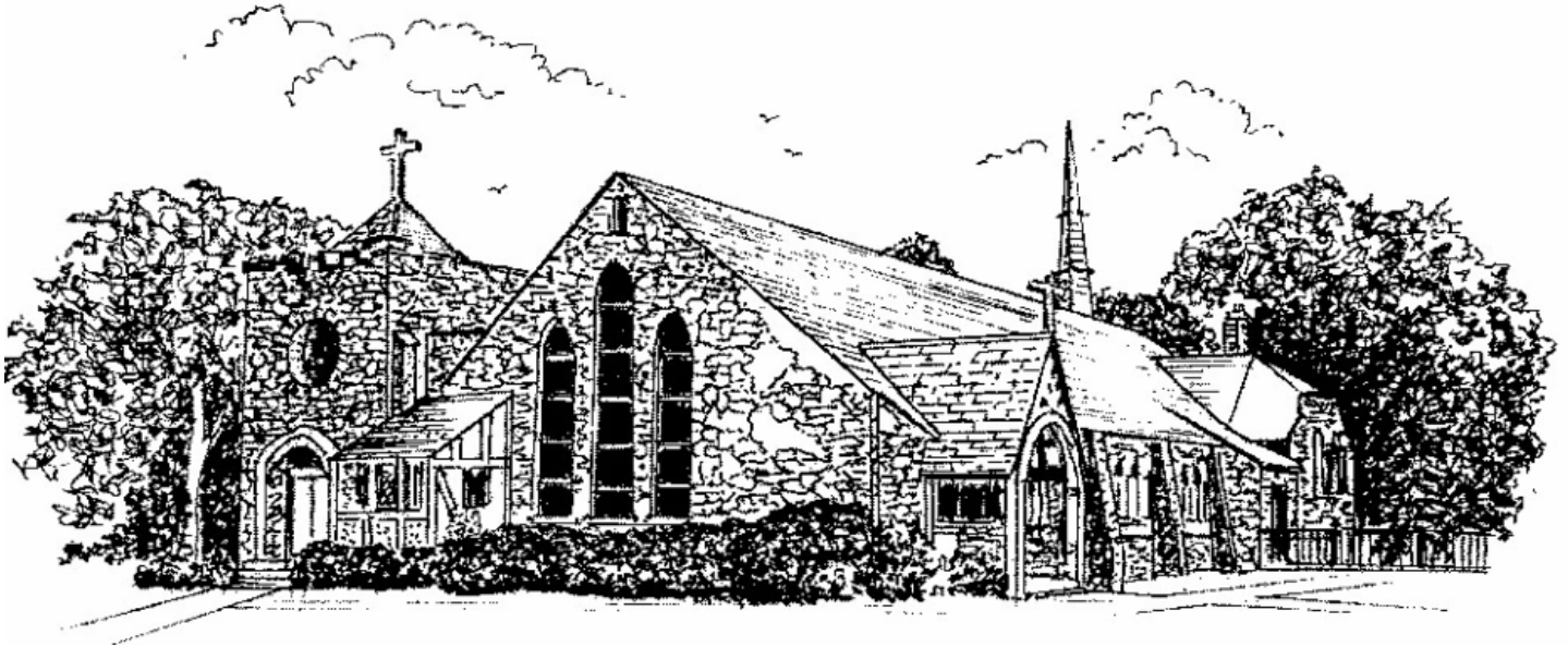
Our Lady of Good Counsel Mission Church